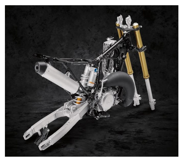
New engine, suspension, expansion chamber swingarm and adjustable handlebars are just some of the changes made to the YZ85

Lightweight 36mm KYB inverted cartridge fork features 274mm of travel with compression and rebound damping adjustability with low-friction outer tubes and internals. For 2019, one-piece outer tubes and new settings offer enhanced performance across a range of conditions and rider abilities. New lower fork guards provide protection and modern styling.