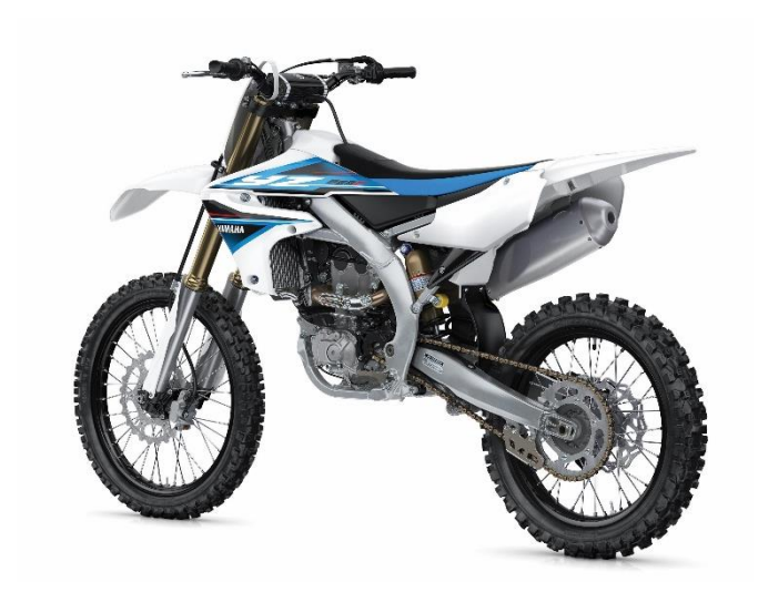
New YZ250F comes in Team Yamaha Blue and White (top) and Competition White (above) priced at just $11,399 RRP inc GST

All new YZ250F features smartphone tuning, electric start and an all new engine and frame package designed to maintain MX2 class dominance