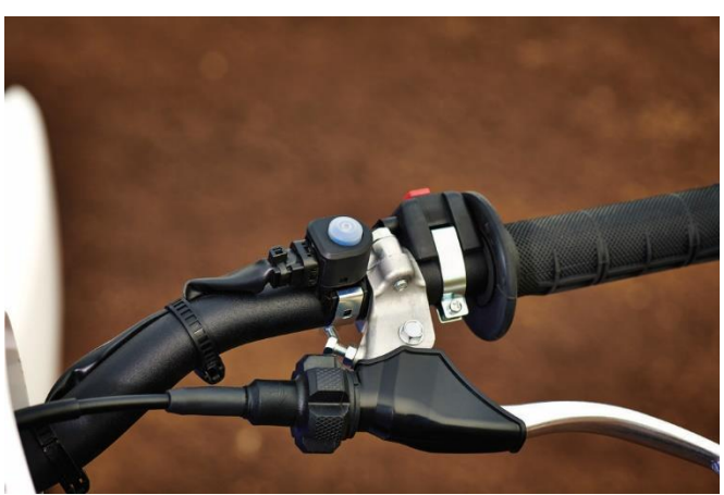
Smart phone tuning (top) and switchable engine mapping (above) offers ultimate convenience and flexibility to YZ250F riders

Two-mode adjustable engine mapping allows the rider to