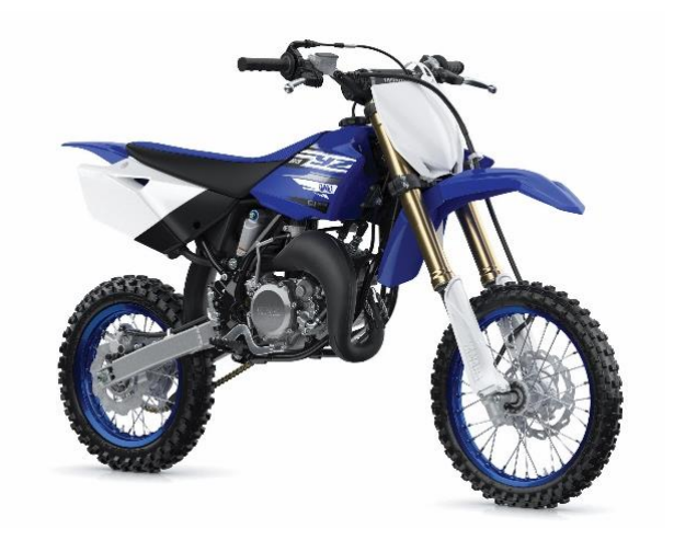
YZ85 is all new for 2019 and features many common parts with YZ65 making bLU cRU the smart choice for riders and maintainers

Like the YZ250F, the 2019 junior MX race model is all new from the ground up - and the winnign two-stroke is now fitted with Yamaha's YPVS power valve system to improve performance. Plus many of the new YZ85 parts are interchangeable with the smaller YZ65, making the step up even less hassle for your young gun's mechanic and sponsor – also known as dad.